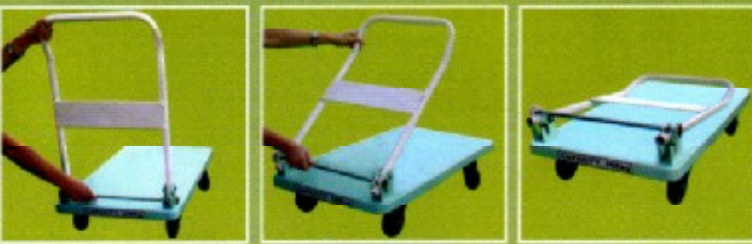
1. Lift the Handle Stopper Shaft up 2. Push the handle downwards 3. The handle is folded